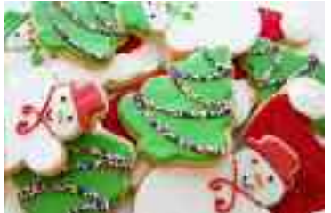
Holiday sugar cookies

It's the middle of December and the holiday pressure dial is on high. You're getting ready to knock out a seasonal book club, family brunch and an ugly sweater party all in one weekend. But what about the holiday bake sale? The Christmas cookie exchange? Snacks for the Snow Ball? Nibbles for New Year's Eve? No time to bake yourself, but looking for something with a little more sentiment than a frozen pie from Safeway? Look no further. Lamorinda's where it's at for bakery treats made with the same love and attention you'd give them yourself ... if you had the time.