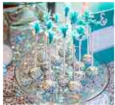
Kitty pops from Kitty Wong's Pastry Shop Photo provided

rooms with flavors ranging from raspberry rose to cranberry orange to pomegranate and pumpkin spice. Her parents are currently digging her mini cheesecakes with cranberry orange sauce. Wong's products are an edible art to grace your holiday table. Check out Kitty Wong at www.kittywongpastry.com or call